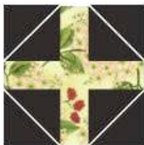
Draw Diagonal Lines on Squares

Place one 3.5 inch square on each corner and sew as shown in the picture below.