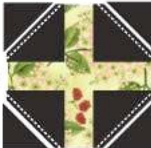
Sew Directly on Diagonal Lines and Trim Corners